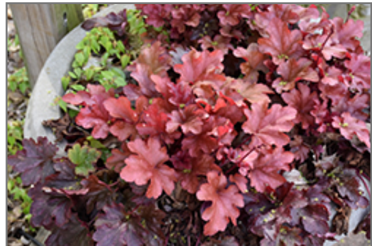
Peach Flambe Coral Bells

Peach Flambe Coral Bells is a fine choice for the garden, but it is also a good selection for planting in outdoor pots and containers. It is often used as a 'filler' in the 'spiller-thriller-filler' container combination, providing a mass of flowers and foliage against which the larger thriller plants stand out. Note that when growing plants in outdoor containers and baskets, they may require more frequent waterings than they would in the yard or garden.