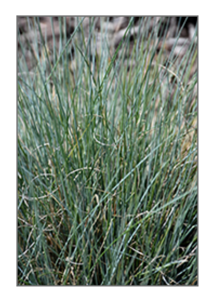
Boulder Blue Fescue foliage