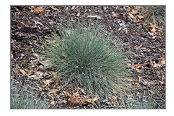
Boulder Blue Fescue