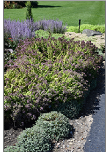
Drops of Jupiter Oregano in bloom