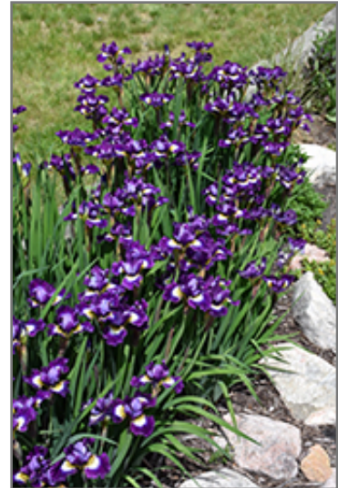
Jewelled Crown Siberian Iris in bloom