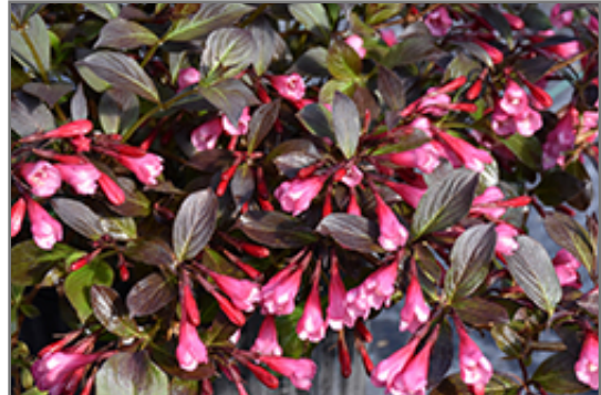
Very Fine Wine Weigela flowers