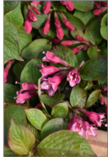
Midnight Sun Reblooming Weigela flowers

Midnight Sun Reblooming Weigela makes a fine choice for the outdoor landscape, but it is also well-suited for use in outdoor pots and containers. It is often used as a 'filler' in the 'spiller-thriller-filler' container combination, providing a mass of flowers and foliage against which the thriller plants stand out. Note that when grown in a container, it may not perform exactly as indicated on the tag - this is to be expected. Also note that when growing plants in outdoor containers and baskets, they may require more frequent waterings than they would in the yard or garden.