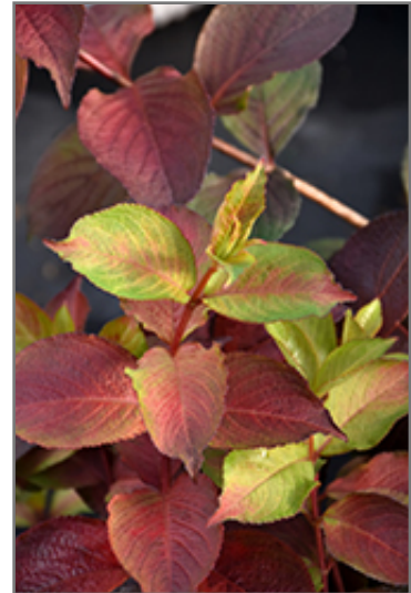
Midnight Sun Reblooming Weigela foliage