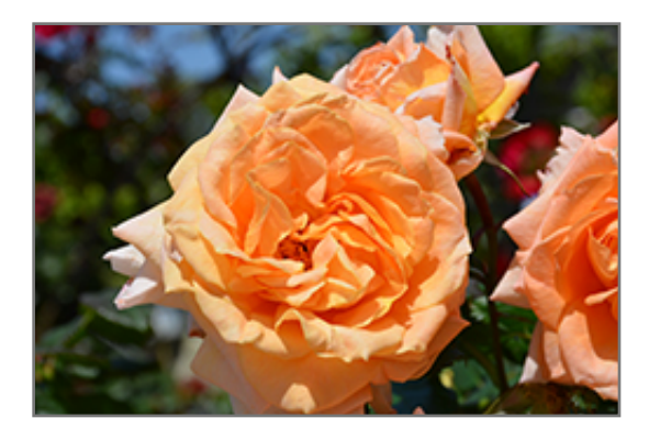
Forever Amber Rose flowers