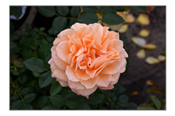
Forever Amber Rose flowers