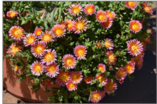
Ocean Sunset Orange Glow Ice Plant flowers