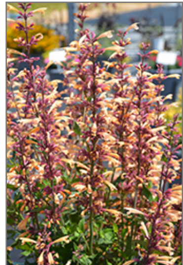
Meant To Bee Queen Nectarine Anise Hyssop flowers

Meant To Bee Queen Nectarine Anise Hyssop is recommended for the following landscape applications;