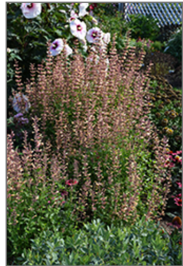
Meant To Bee Queen Nectarine Anise Hyssop in bloom

Meant To Bee Queen Nectarine Anise Hyssop is a fine choice for the garden, but it is also a good selection for planting in outdoor pots and containers. With its upright habit of growth, it is best suited for use as a 'thriller' in the 'spiller-thriller-filler' container combination; plant it near the center of the pot, surrounded by smaller plants and those that spill over the edges. It is even sizeable enough that it can be grown alone in a suitable container. Note that when growing plants in outdoor containers and baskets, they may require more frequent waterings than they would in the yard or garden.