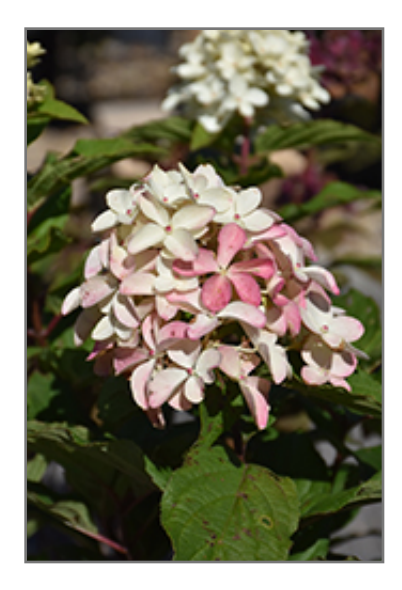
Quick Fire Fab Hydrangea flowers