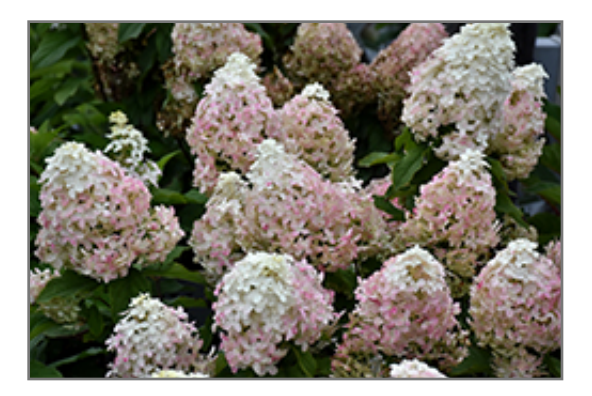
Quick Fire Fab Hydrangea flowers