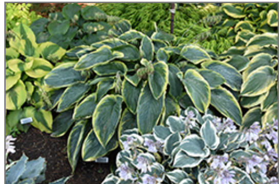
Shadowland Wu-La-La Hosta