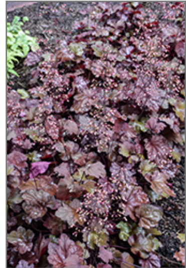
Carnival Burgundy Blast Coral Bells in bloom