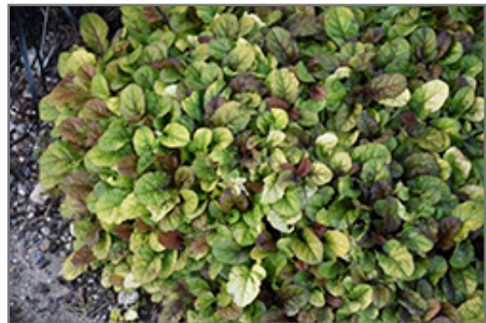
Feathered Friends Parrot Paradise Bugleweed