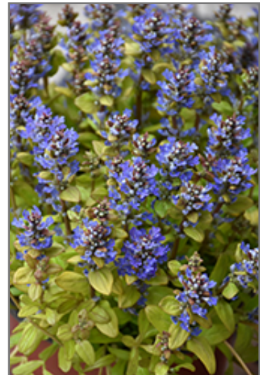
Feathered Friends Fancy Finch Bugleweed flowers