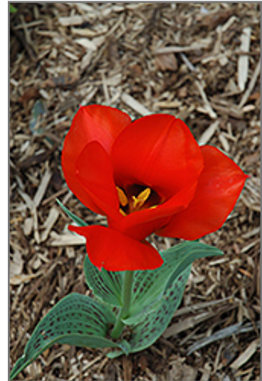
Casa Grande Tulip flowers