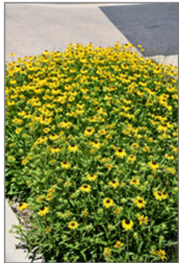
Viette's Little Suzy Coneflower in bloom