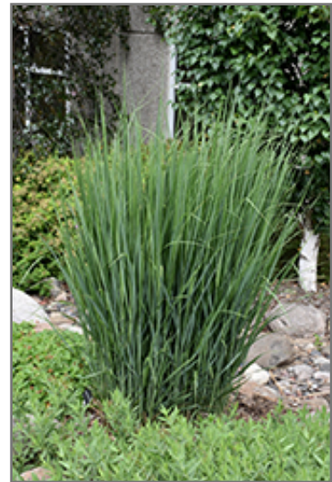
Northwind Switch Grass