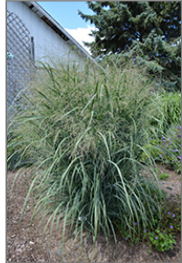
Northwind Switch Grass in bloom

This plant does best in full sun to partial shade. It is very adaptable to both dry and moist locations, and should do just fine under typical garden conditions. It is considered to be drought-tolerant, and thus makes an ideal choice for a low-water garden or xeriscape application. It is not particular as to soil type, but has a definite preference for alkaline soils, and is able to handle environmental salt. It is somewhat tolerant of urban pollution. This is a selection of a native North American species. It can be propagated by division; however, as a cultivated variety, be aware that it may be subject to certain restrictions or prohibitions on propagation.