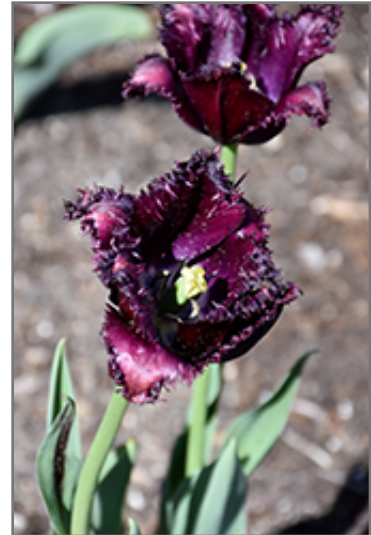
Black Parrot Tulip flowers