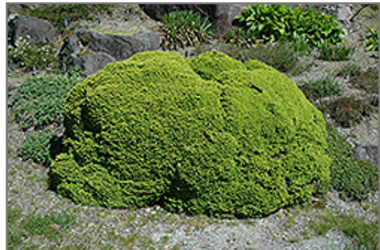
Little Gem Spruce