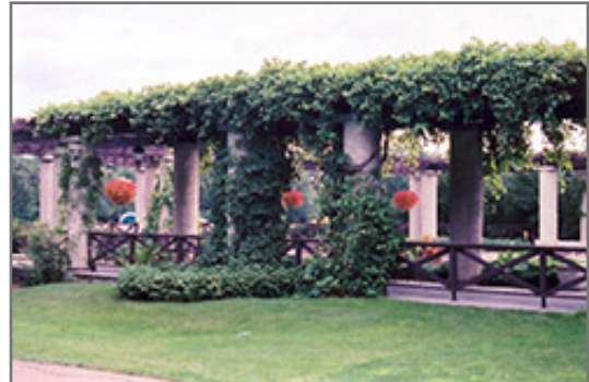
Virginia Creeper