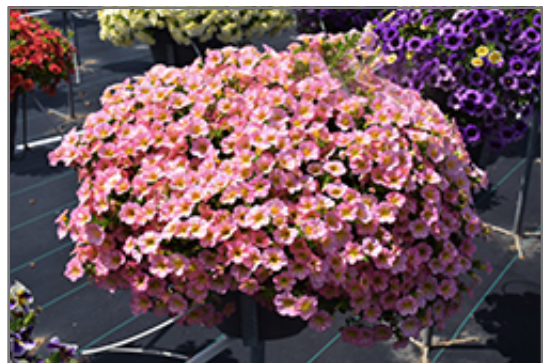
Superbells Honeyberry Calibrachoa in bloom