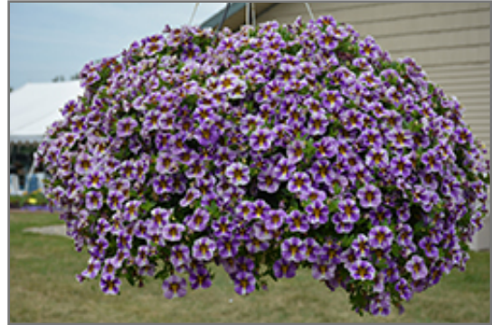
Superbells Holy Smokes! Calibrachoa in bloom