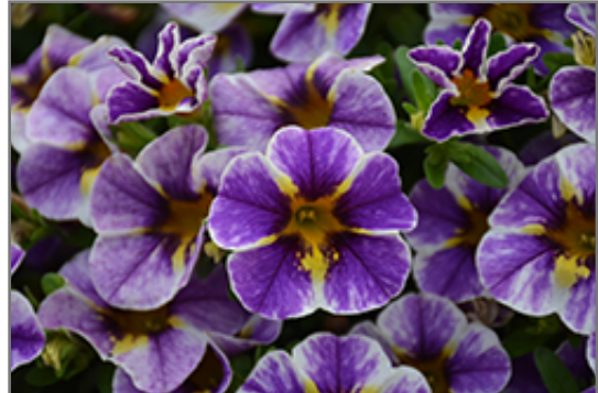
Superbells Holy Smokes! Calibrachoa flowers

Superbells Holy Smokes! Calibrachoa is a dense herbaceous annual with a trailing habit of growth, eventually spilling over the edges of hanging baskets and containers. Its medium texture blends into the garden, but can always be balanced by a couple of finer or coarser plants for an effective composition.