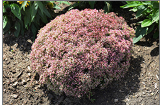
Rock 'N Round Pride and Joy Stonecrop in bloom