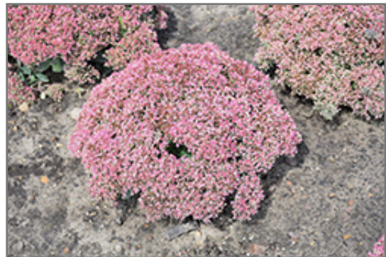
Rock 'N Round Pride and Joy Stonecrop in bloom