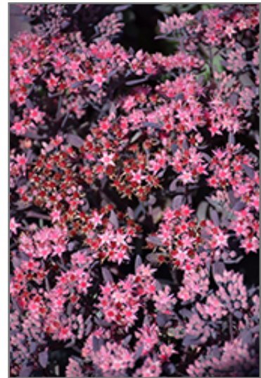
Plum Dazzled Stonecrop flowers

Plum Dazzled Stonecrop is a dense herbaceous perennial with an upright spreading habit of growth. Its medium texture blends into the garden, but can always be balanced by a couple of finer or coarser plants for an effective composition.