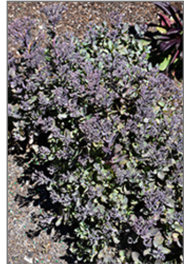
Dynomite Stonecrop in bloom