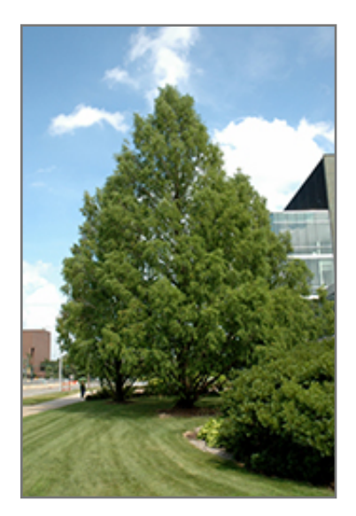
Dawn Redwood