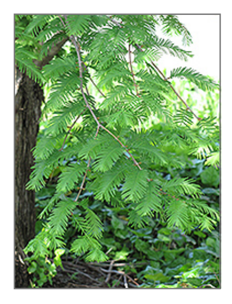
Dawn Redwood foliage