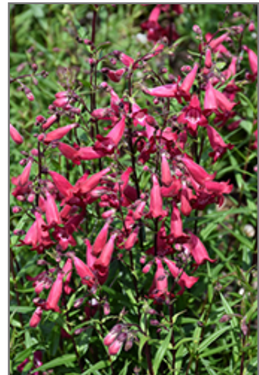
MissionBells Deep Rose Beard Tongue flowers

MissionBells Deep Rose Beard Tongue is recommended for the following landscape applications;