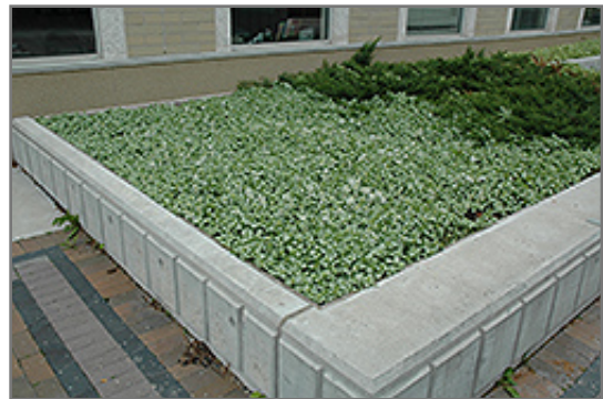
White Nancy Spotted Dead Nettle in bloom