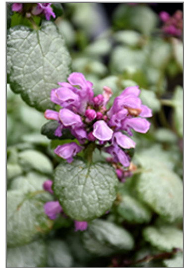
Red Nancy Spotted Dead Nettle flowers