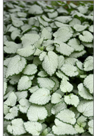
Red Nancy Spotted Dead Nettle foliage

Red Nancy Spotted Dead Nettle is a fine choice for the garden, but it is also a good selection for planting in outdoor pots and containers. Because of its spreading habit of growth, it is ideally suited for use as a 'spiller' in the 'spiller-thriller-filler' container combination; plant it near the edges where it can spill gracefully over the pot. Note that when growing plants in outdoor containers and baskets, they may require more frequent waterings than they would in the yard or garden.