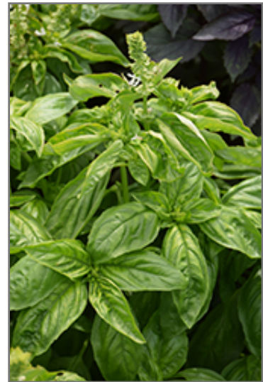
Genovese Basil foliage

Genovese Basil will grow to be about 20 inches tall at maturity, with a spread of 14 inches. When grown in masses or used as a bedding plant, individual plants should be spaced approximately 12 inches apart. This fast-growing annual will normally live for one full growing season, needing replacement the following year.