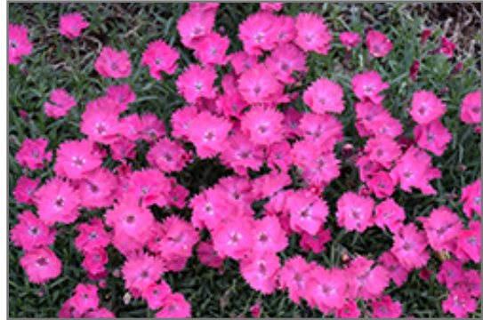
Vivid Bright Light Pinks flowers

Vivid Bright Light Pinks is recommended for the following landscape applications;