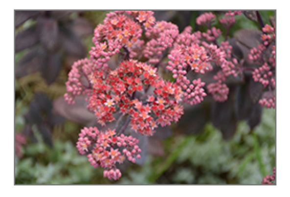
Night Embers Stonecrop flowers