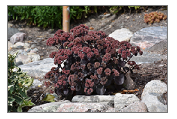
Night Embers Stonecrop in bloom

This is a relatively low maintenance plant, and is best cleaned up in early spring before it resumes active growth for the season. It is a good choice for attracting bees and butterflies to your yard, but is not particularly attractive to deer who tend to leave it alone in favor of tastier treats. It has no significant negative characteristics.