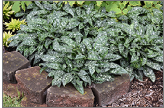
Twinkle Toes Lungwort

Twinkle Toes Lungwort will grow to be about 12 inches tall at maturity, with a spread of 18 inches. When grown in masses or used as a bedding plant, individual plants should be spaced approximately 15 inches apart. Its foliage tends to remain dense right to the ground, not requiring facer plants in front. It grows at a medium rate, and under ideal conditions can be expected to live for approximately 10 years. As an herbaceous perennial, this plant will usually die back to the crown each winter, and will regrow from the base each spring. Be careful not to disturb the crown in late winter when it may not be readily seen!