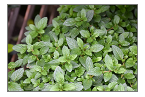
Peppermint foliage

Peppermint features bold spikes of lavender flowers with pink overtones rising above the foliage in mid summer. Its attractive fragrant pointy leaves remain green in color throughout the season.