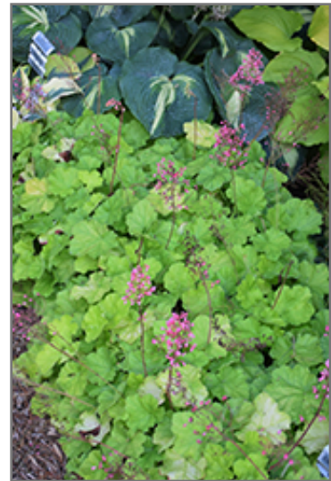
Primo Pretty Pistachio Coral Bells in bloom

This is a relatively low maintenance plant, and should be cut back in late fall in preparation for winter. It is a good choice for attracting butterflies and hummingbirds to your yard. It has no significant negative characteristics.