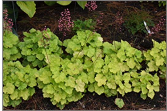
Primo Pretty Pistachio Coral Bells

Primo Pretty Pistachio Coral Bells is a fine choice for the garden, but it is also a good selection for planting in outdoor pots and containers. With its upright habit of growth, it is best suited for use as a 'thriller' in the 'spiller-thriller-filler' container combination; plant it near the center of the pot, surrounded by smaller plants and those that spill over the edges. Note that when growing plants in outdoor containers and baskets, they may require more frequent waterings than they would in the yard or garden.