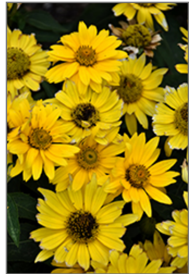
Tuscan Gold False Sunflower flowers

Tuscan Gold False Sunflower is recommended for the following landscape applications;