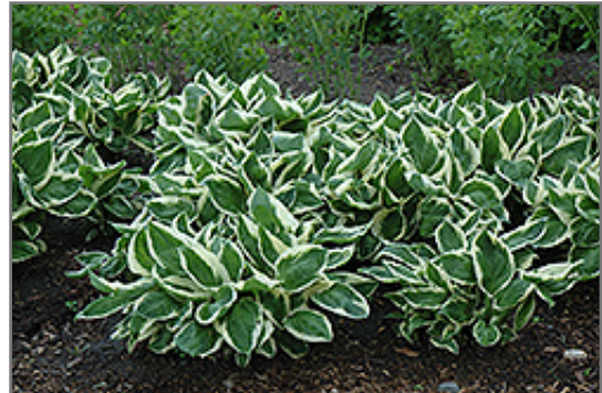
Minuteman Hosta