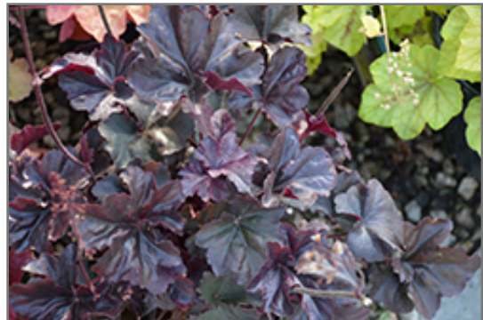
Obsidian Coral Bells foliage