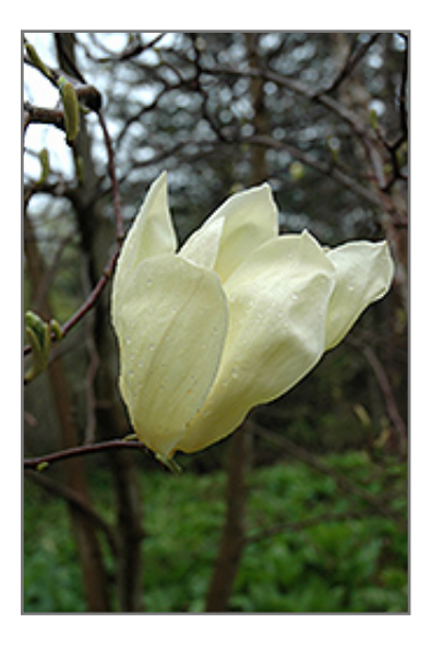
Cucumber Magnolia flowers