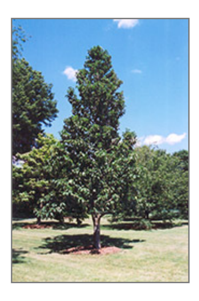
Cucumber Magnolia

This tree does best in full sun to partial shade. It requires an evenly moist well-drained soil for optimal growth, but will die in standing water. It is not particular as to soil type, but has a definite preference for acidic soils. It is quite intolerant of urban pollution, therefore inner city or urban streetside plantings are best avoided. Consider applying a thick mulch around the root zone in winter to protect it in exposed locations or colder microclimates. This species is native to parts of North America.