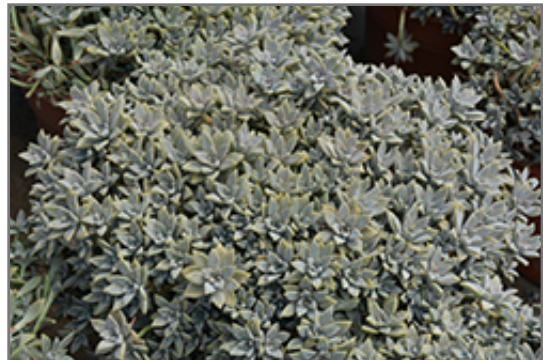
Ghost Plant

Ghost Plant is recommended for the following landscape applications;