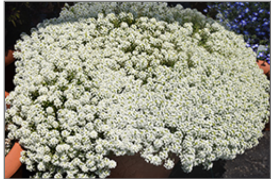
Snow Globe Alyssum in bloom