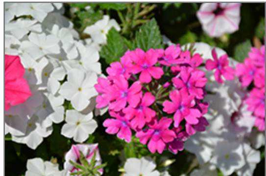
Superbena Pink Shades Verbena flowers

Superbena Pink Shades Verbena is recommended for the following landscape applications;