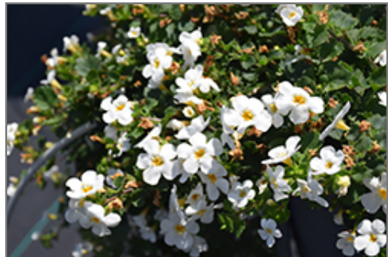
Snowstorm Snow Globe Bacopa flowers