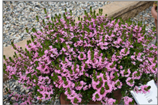
Whirlwind Pink Fan Flower in bloom