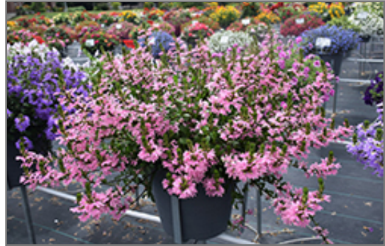
Whirlwind Pink Fan Flower in bloom

Whirlwind Pink Fan Flower will grow to be about 12 inches tall at maturity, with a spread of 24 inches. When grown in masses or used as a bedding plant, individual plants should be spaced approximately 12 inches apart. Its foliage tends to remain dense right to the ground, not requiring facer plants in front. Although it's not a true annual, this fast-growing plant can be expected to behave as an annual in our climate if left outdoors over the winter, usually needing replacement the following year. As such, gardeners should take into consideration that it will perform differently than it would in its native habitat.