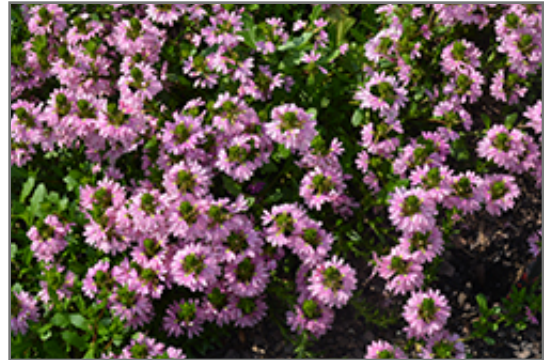
Whirlwind Pink Fan Flower flowers