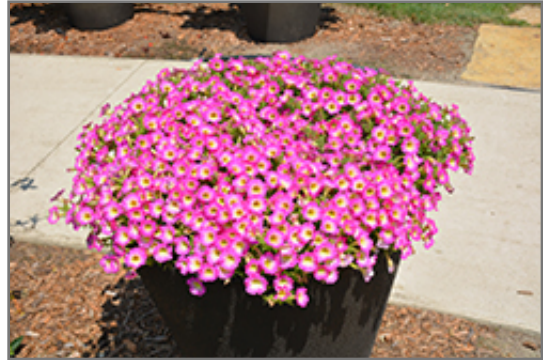
Supertunia Daybreak Charm Petunia in bloom

Supertunia Daybreak Charm Petunia will grow to be about 10 inches tall at maturity, with a spread of 24 inches. When grown in masses or used as a bedding plant, individual plants should be spaced approximately 15 inches apart. Its foliage tends to remain low and dense right to the ground. This fast-growing annual will normally live for one full growing season, needing replacement the following year.