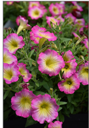
Supertunia Daybreak Charm Petunia flowers

This plant will require occasional maintenance and upkeep. Trim off the flower heads after they fade and die to encourage more blooms late into the season. It is a good choice for attracting butterflies and hummingbirds to your yard, but is not particularly attractive to deer who tend to leave it alone in favor of tastier treats. It has no significant negative characteristics.