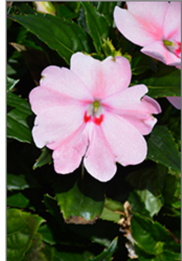
SunPatiens Spreading Pink Kiss New Guinea Impatiens flowers