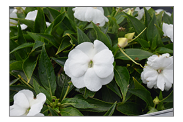
Infinity White New Guinea Impatiens flowers