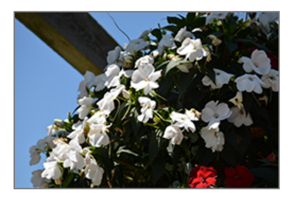
Infinity White New Guinea Impatiens flowers