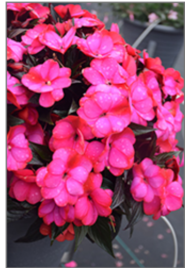
Infinity Blushing Lilac New Guinea Impatiens flowers