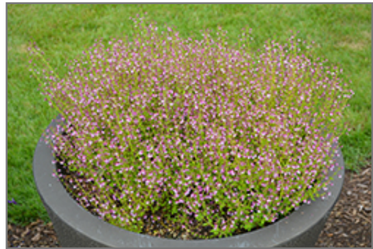
Fairy Dust Pink Cuphea in bloom

Fairy Dust Pink Cuphea will grow to be about 12 inches tall at maturity extending to 16 inches tall with the flowers, with a spread of 15 inches. When grown in masses or used as a bedding plant, individual plants should be spaced approximately 10 inches apart. Its foliage tends to remain dense right to the ground, not requiring facer plants in front. Although it's not a true annual, this plant can be expected to behave as an annual in our climate if left outdoors over the winter, usually needing replacement the following year. As such, gardeners should take into consideration that it will perform differently than it would in its native habitat.