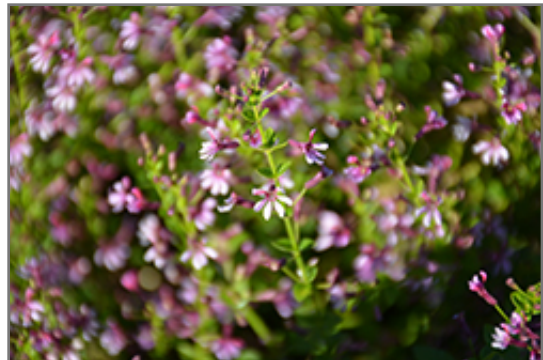
Fairy Dust Pink Cuphea flowers

Fairy Dust Pink Cuphea is recommended for the following landscape applications;