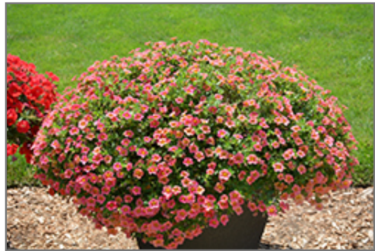
Superbells Tropical Sunrise Calibrachoa in bloom