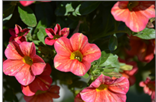
Superbells Tropical Sunrise Calibrachoa flowers

Superbells Tropical Sunrise Calibrachoa is a dense herbaceous annual with a trailing habit of growth, eventually spilling over the edges of hanging baskets and containers. Its medium texture blends into the garden, but can always be balanced by a couple of finer or coarser plants for an effective composition.